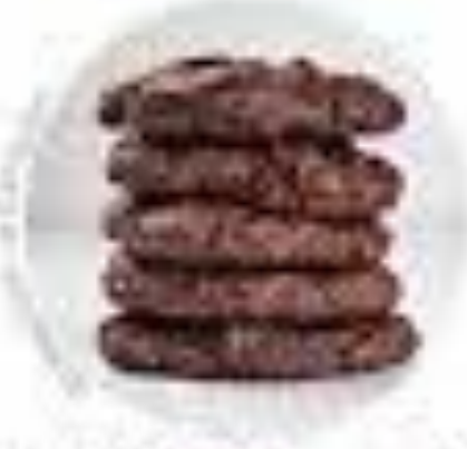
F. Double Chocolate