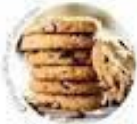
A. Chocolate Chip