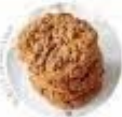
B. Oatmeal Raisin