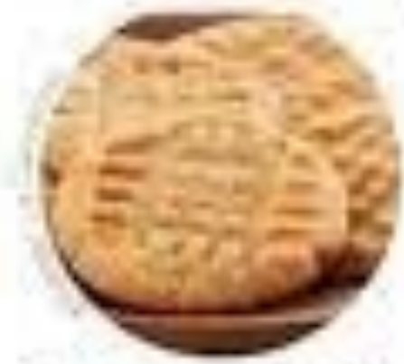
D. Peanut Butter