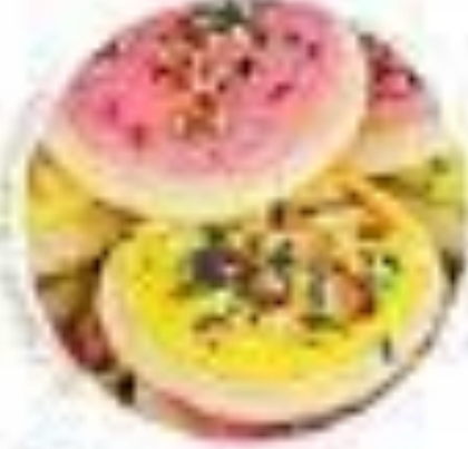
E. Frosted Sugar